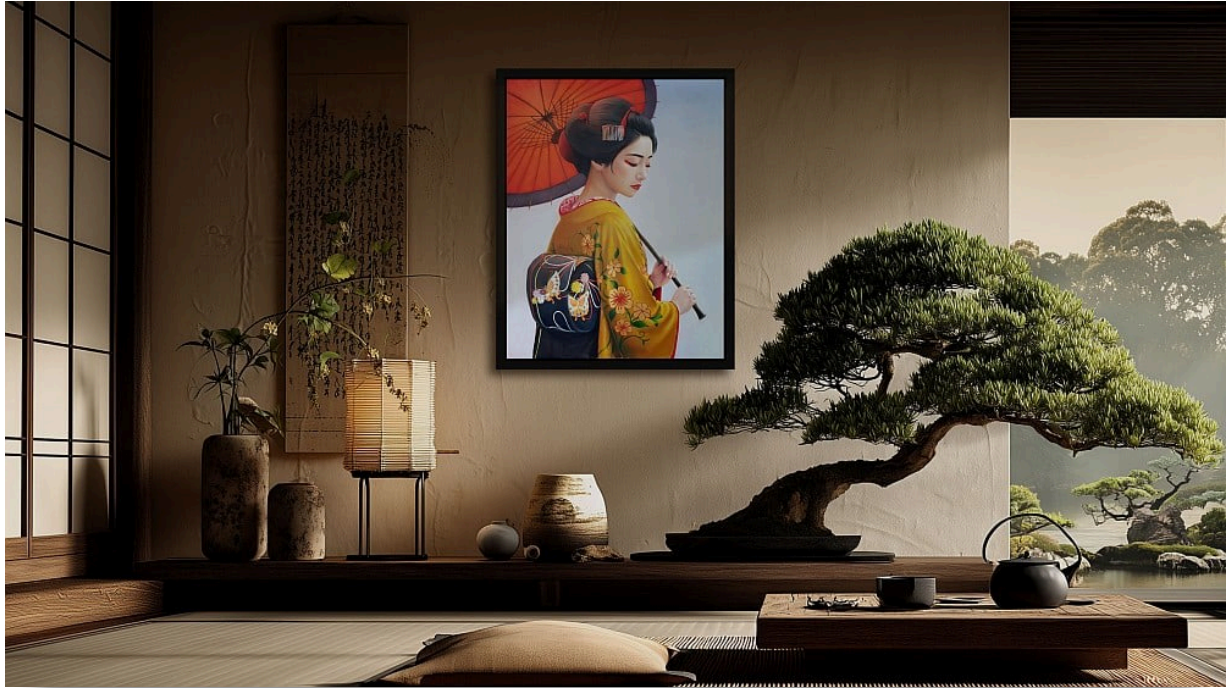
Above: "Imperial Reverie" (2025), 36" tall x 28" wide, original oil painting on canvas by Simon Quinn.