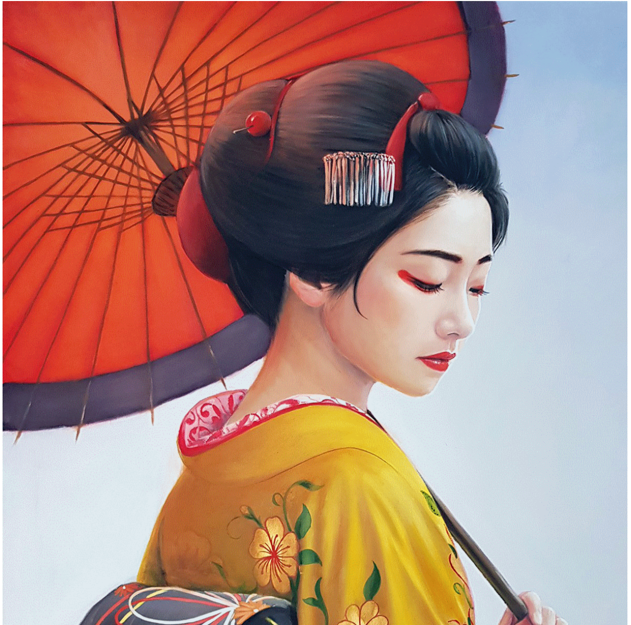
Above: " Imperial Reverie " (2025), by Simon Quinn - detailed images