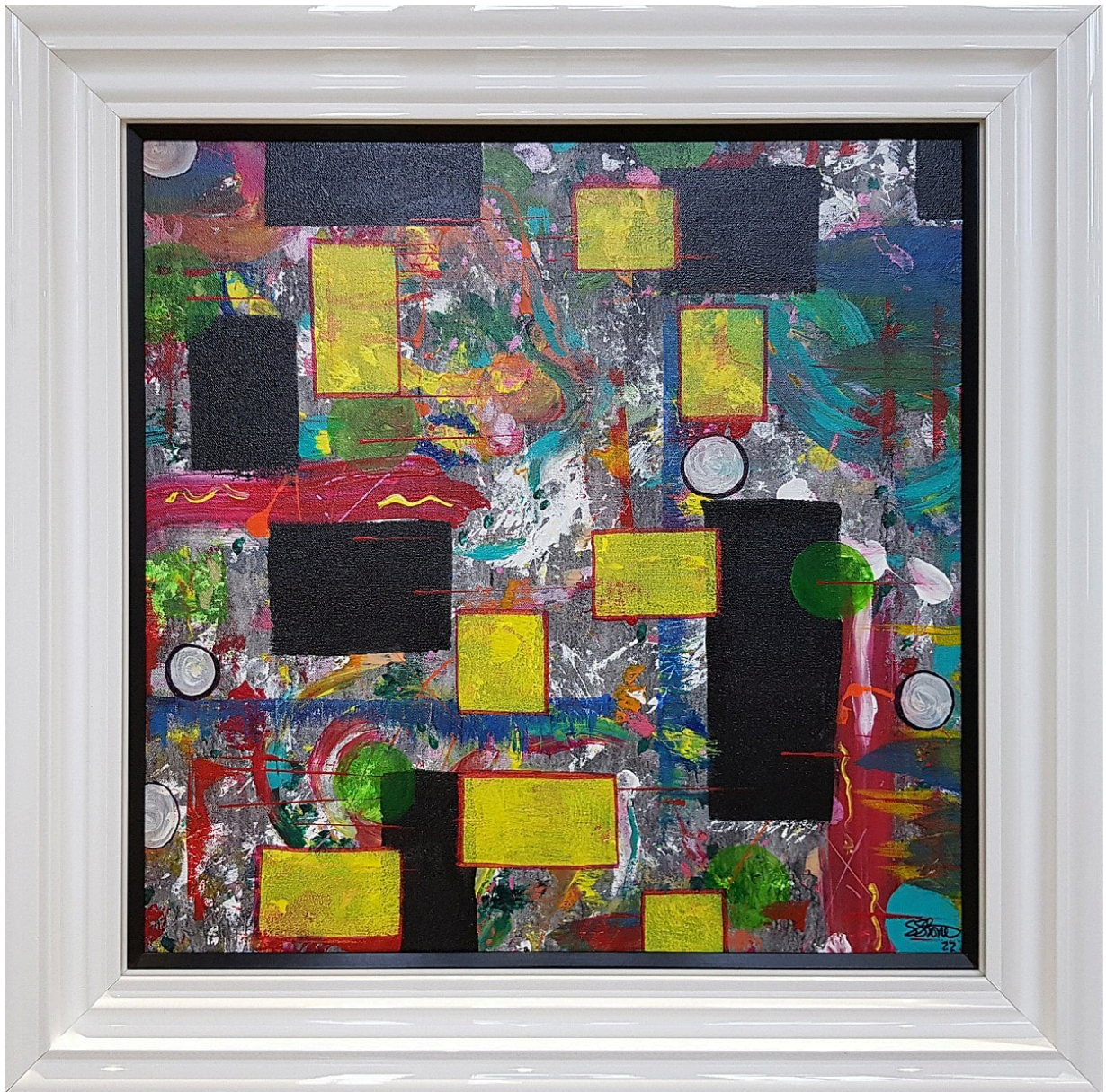
Above: "Secrets of The Universe", (2022) by Sharon Stone Framed, mixed media on canvas. Canvas size: 61 cm x 61 cm / 24" x 24"

part of our secondary market, Art Resale portfolio and is offered for sale by Oil Art Advisory.