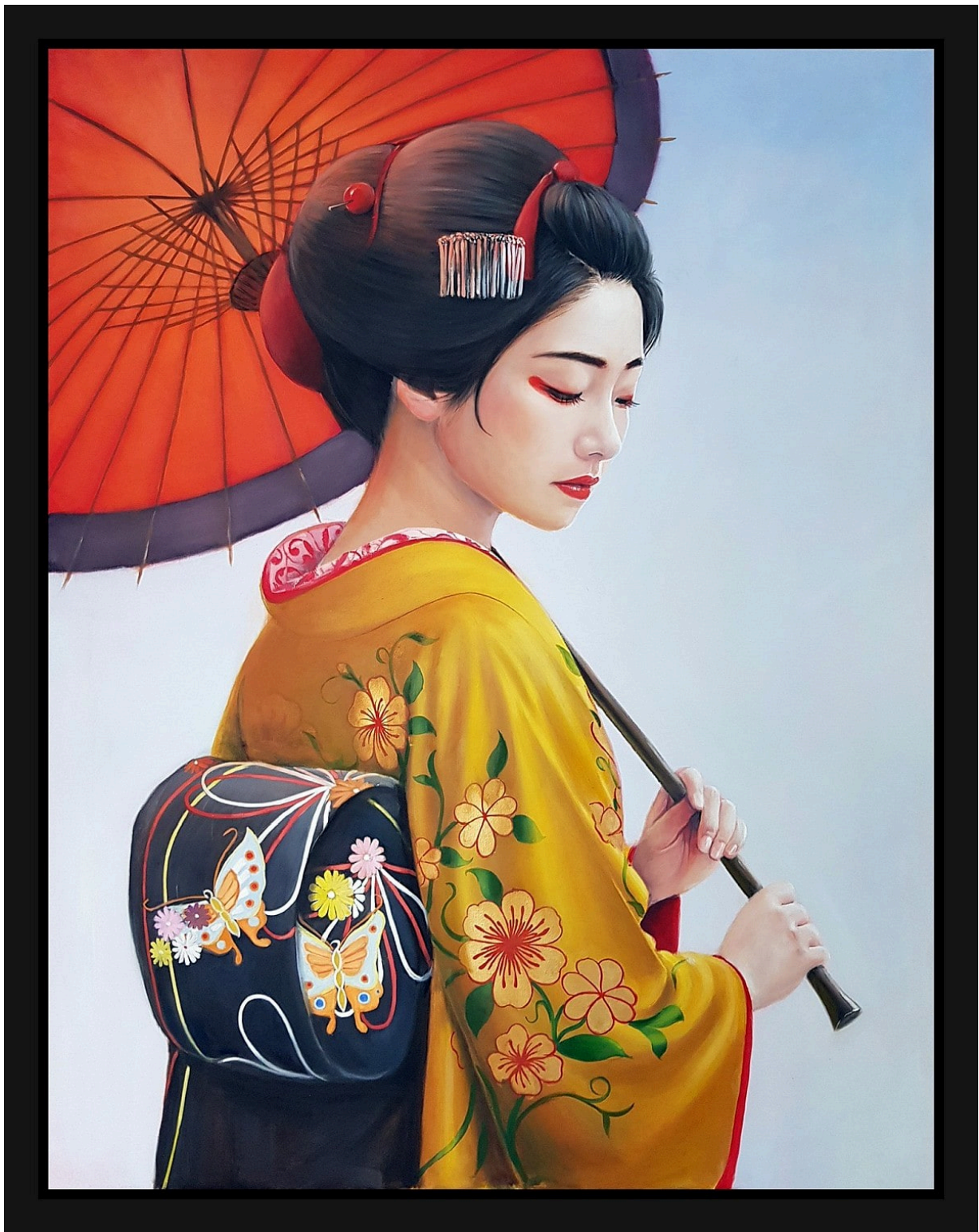
Above: " Imperial Reverie " (2025), 36" x 28", original oil painting on canvas by Simon Quinn.