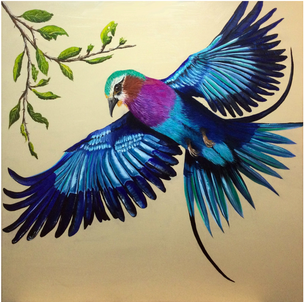
Above: A working photograph of the latest painting by Kerry Ann Lyons - Available shortly.