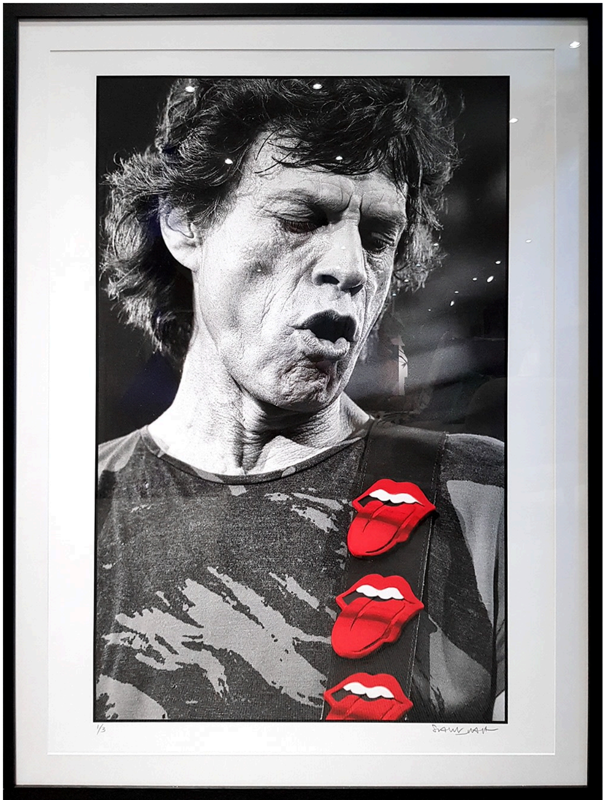
Above: "Jagger X Scarlet" (2025) by Scarlet Page