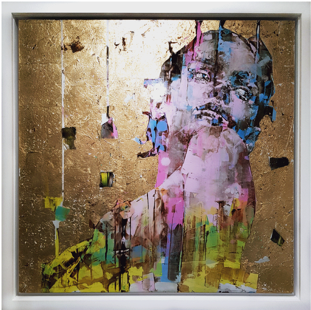
Above: "Golden Beauty" (2018) by Marco Grassi