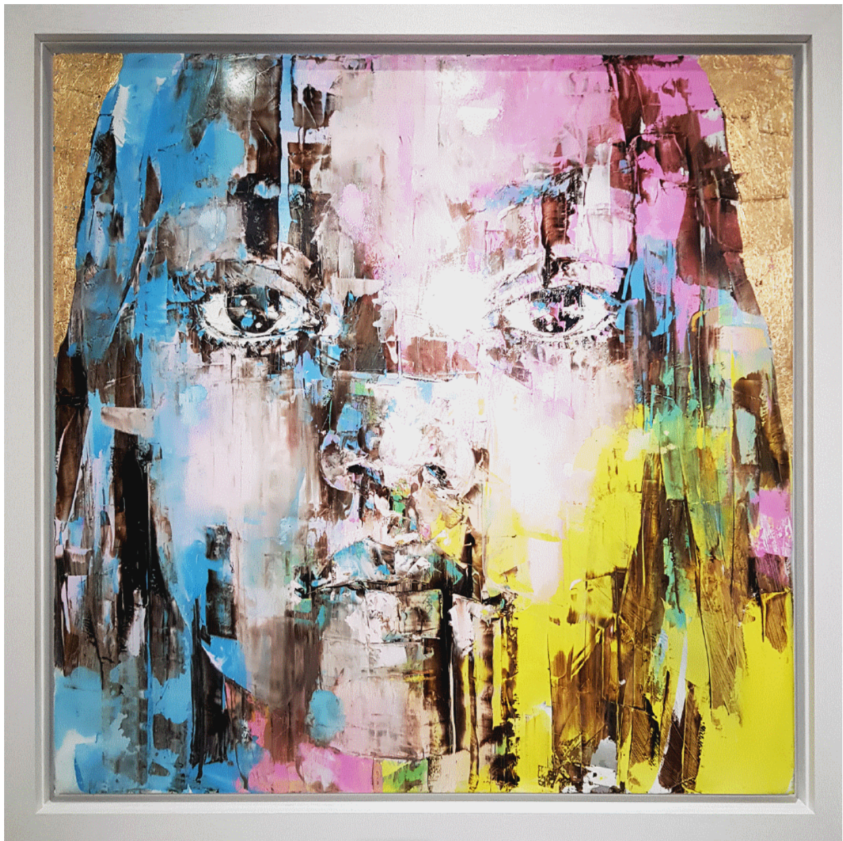
Above: "Golden Girl" (2018) by Marco Grassi