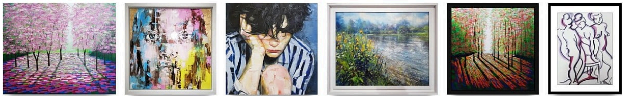
Above: A screen capture from the homepage of the Oil website, showing the latest artworks to arrive in the gallery. TIP: Clicking on the "NEW ARRIVALS »" title when on the homepage, also links to the comprehensive new arrivals page.